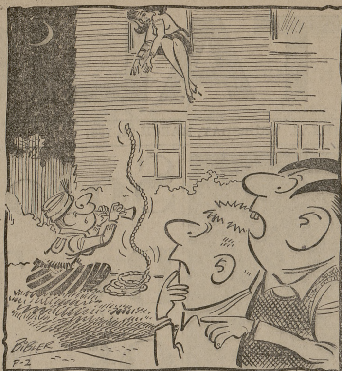
"NO WONDER ALL TH' GIRLS ARE SO ANXIOUS TO DATE FOREIGN STUDENTS."