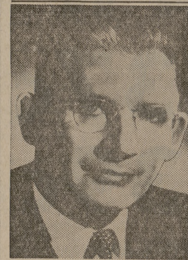
U. S. Senator Paul H. Douglas

THE GREAT ISSUES COMMITTEE OF THE MEMORIAL STUDENT CENTER