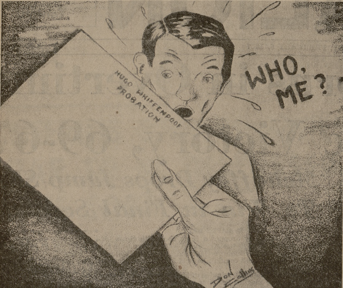
That Little Pink Card!