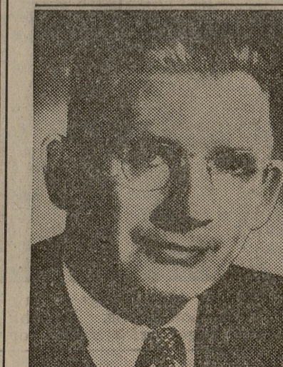
U. S. Senator Paul H. Douglas