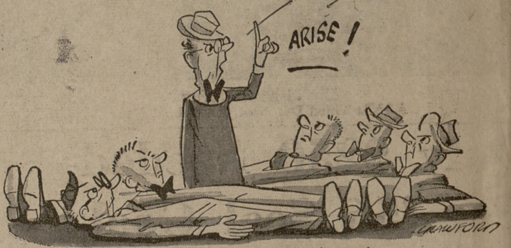
the students did not take that lyars down.

MORAL: Don't fight the hand that feeds you.