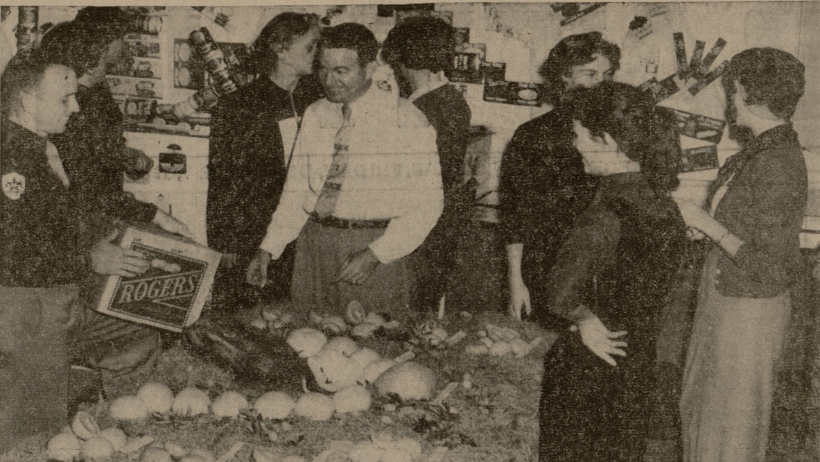
HORTICULTURE FRUIT DISPLAY —secretaries from various departments in the Agriculture building take a few minutes off to browse around the Horticulture Display in the main lobby on the first floor of the Agriculture Building. Over 400 cartons of Texas Ruby Red Grapefruit are on sale at the exhibit by members of the A&M Horticulture club to help pay for trips by members to visit various centers of activity throughout the state during the spring semester.