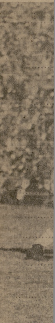
JOHN DAVI... for eight ya... day afternoo...