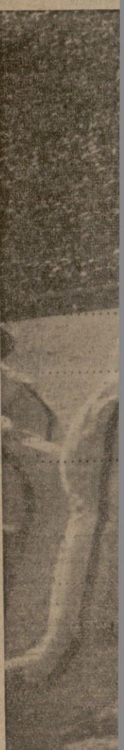
RODDY OS... the running... all opponen...