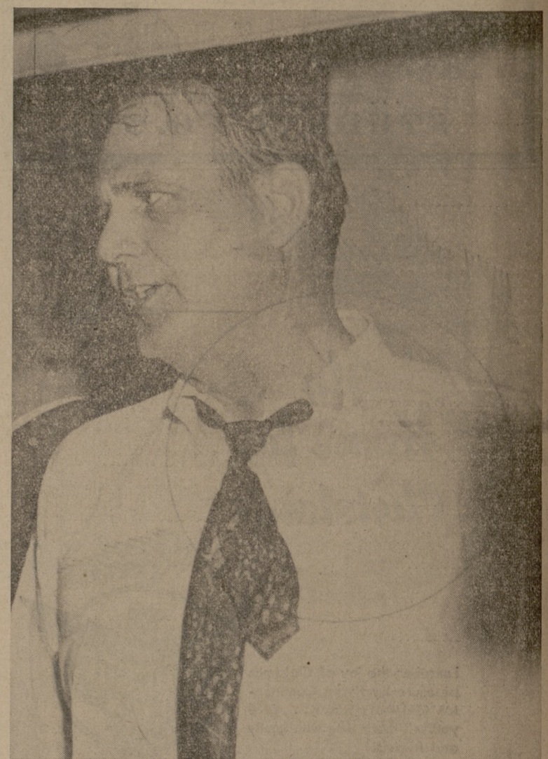
PORE TEA-SIPS —Coach Paul (Bear) Bryant, very wet and happy at the time this shot was made had just emerged from his umpteenth shot in the shower after the Turkey Bowl game at Austin.