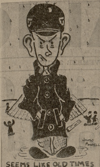
SEEMS LIKE OLD TIMES

MEMPHIS, Tenn.—(AP)—“The Bad Seed”, a movie about a monstrous 9-year-old girl who commits several particularly unsavory murders was passed for showing by the three-women Memphis Board of Censors—but not without a deletion. The board held the picture—despite its shocking theme—could be shown on an “adults only” basis. But one word, spoken by actress Eileen Heckart, had to go. The word: “Privy.”