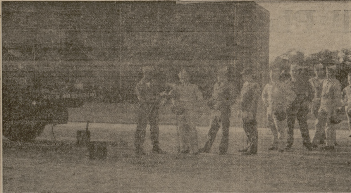
GETTING READY for Fall Military Day this Saturday, helmet liners for the Corps have been painted. A full Corps review will be held Saturday in honor of the visiting civilian and military dignitaries.

Texas A&M has conferred 28,526 degrees through August 31, 1956.