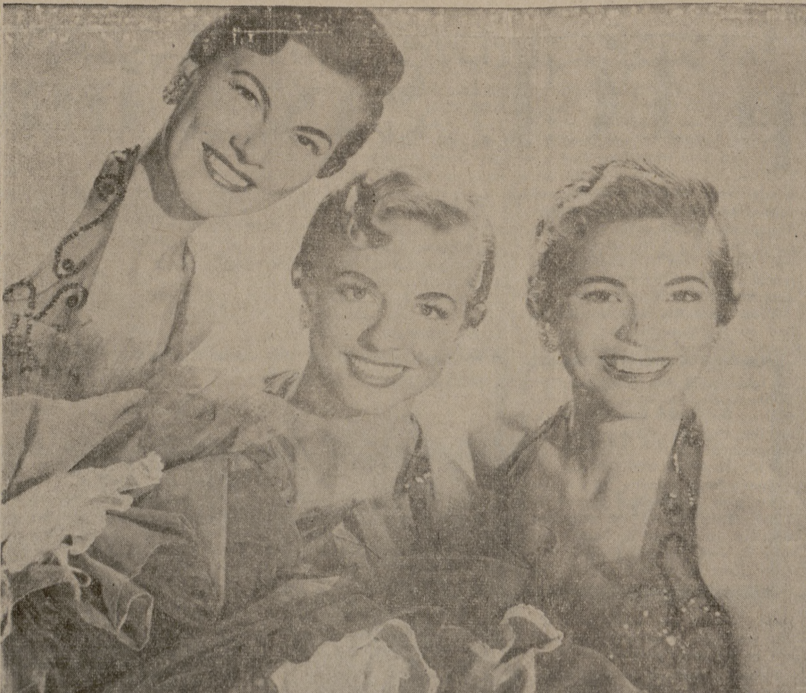
THE THREE PETTICOATS —featured with the Tony Martin Show which will be presented Thursday night in the G. Rollie White Coliseum along with the music of Tex Beneke Orchestra. These three and more will be on hand to present an evening of entertainment.