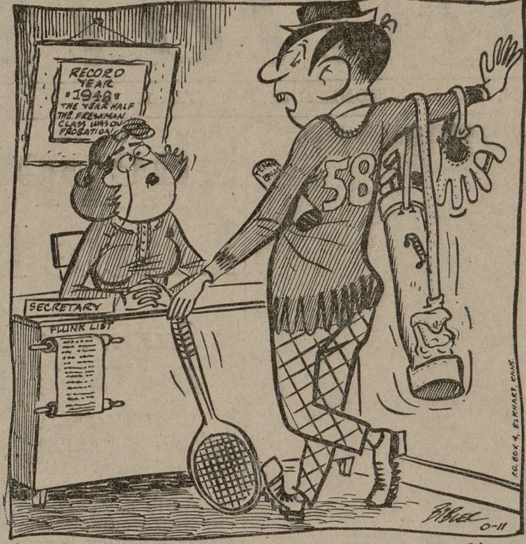
"WHAT'S THIS I HEAR ABOUT ME BEIN' ON PROBATION?"