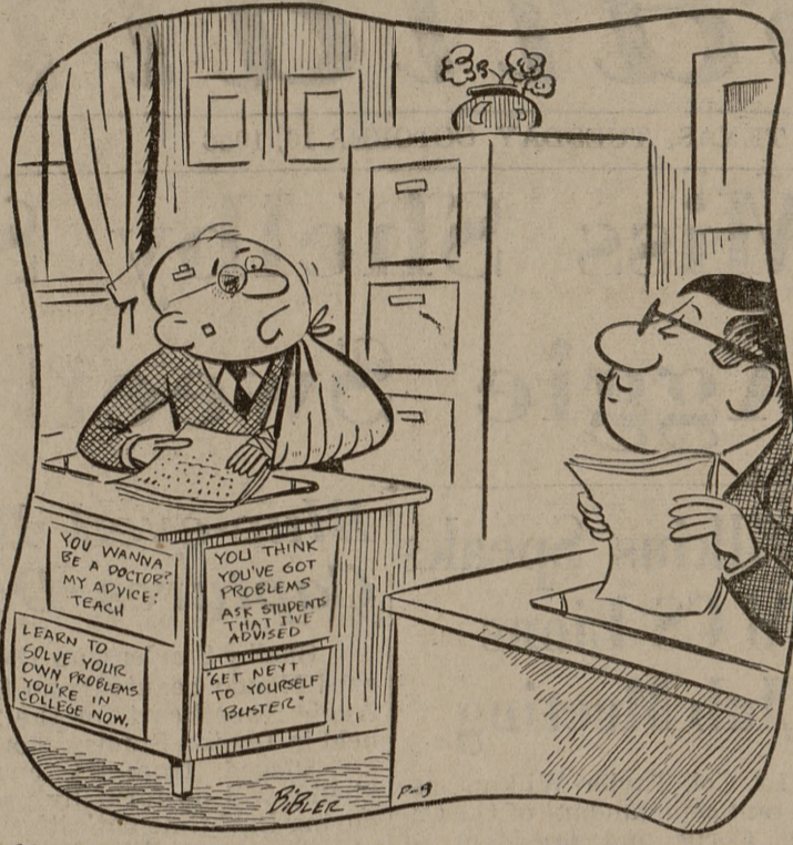
"FRANKLY I'D RATHER ADVISE FRESHMEN—THEY'RE NOT SO SET IN THEIR WAYS."