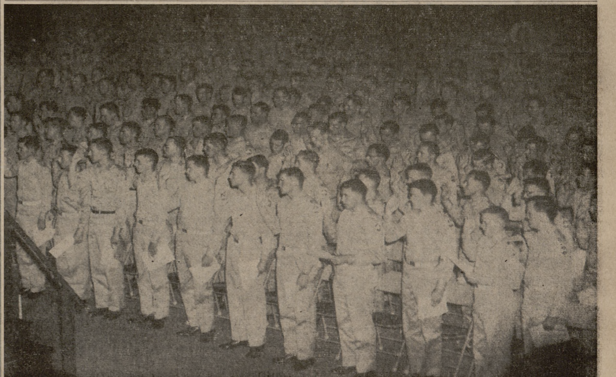
OATH OF OFFICE is administered to 650 Cadets in swearing in ceremonies in G. Rollie White Coliseum yesterday afternoon. The entire corps of cadets attended the rites.

Generally fair weather with some high scattered clouds are forecast. The 10:30 a.m. temperature was 79 degrees. Yesterday's high and low readings were 92 and 55 degrees.