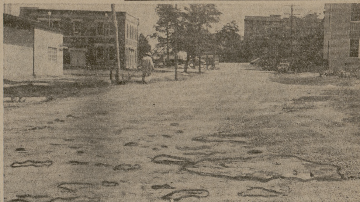
ONE OF A&M'S "HOLY" STREETS —Scheduled for early repair, this scene is typical of the condition found when traveling down Nagle St. which runs beside the A&M Press Building down by the Shack Area. Now in axle-breaking condition the street is shown being traveled by a wise man—on foot.