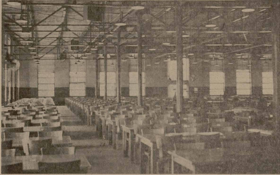
CHAIRS, CHAIRS, EVERYWHERE —These are the new tables and chairs that have been placed in Duncan Mess Hall this summer. Duncan, the second largest stationary mess hall in the world, serves the A&M students living in the south area of the campus. The largest mess hall in the world is Sbisal, also located on the Aggie campus.