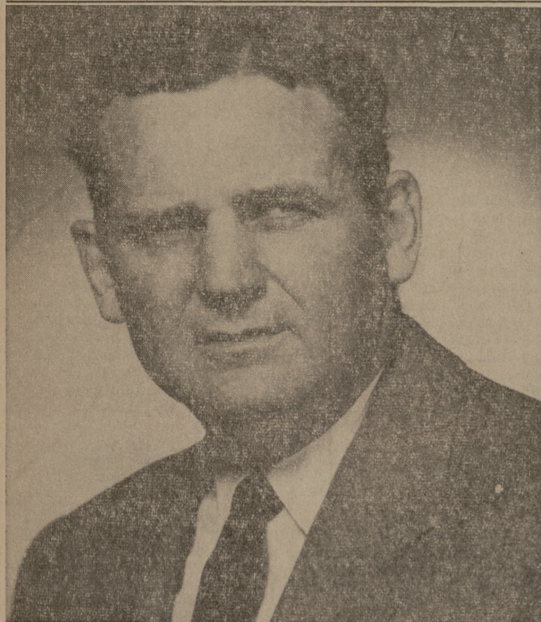
Coach Paul (Bear) Bryant

COLLEGE STATION, TEXAS, THURSDAY, AUGUST 23, 1956