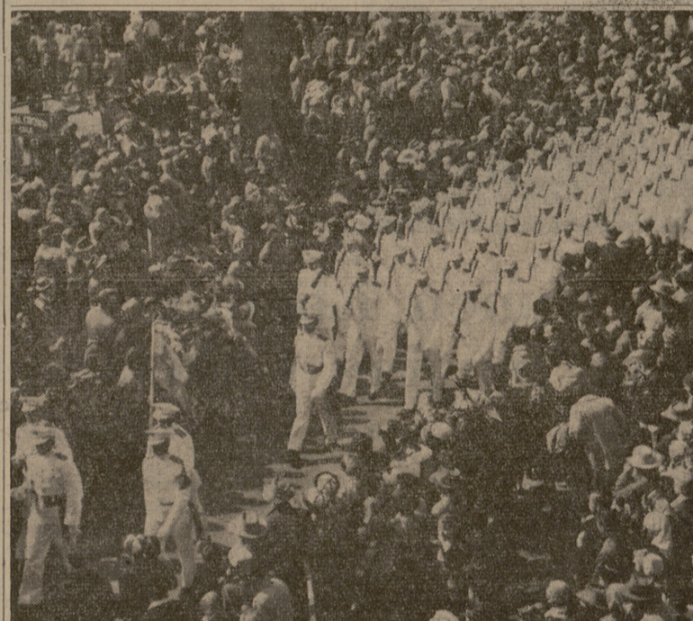
ROSS VOLUNTEERS SERVE AS HONOR GUARD DURING MARDI GRAS—Leading the parade down world famous Canal Street in New Orleans the Ross Volunteers of A&M during Mardi Gras activities served as honor guard to His Majesty King Rex. Eligible juniors and seniors are chosen annually for membership in the crack military drill company, named for A&M's first president Lawrence Sullivan Ross.

Large parcels and boxes, such as footlockers, should be shipped to school and be sure to ship them early enough to allow them time to get to College Station before you need them. Address them to yourself Texas A&M College, College Station and send them by rail.