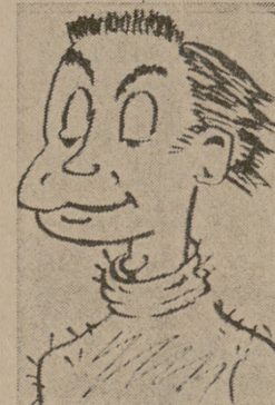
Bop & Jazz

Listen to your selections in our private air conditioned audition booths.