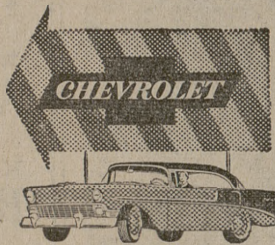
America's largest selling car—2 million more owners than any other make!

You can see that the '56 Chevy is a standout for style. But until you have driven one you're missing the best part of the news—the fact that Chevrolet is the smoothest, solidest, most wedded-to-the-road automobile you ever bossed. Try it and see.