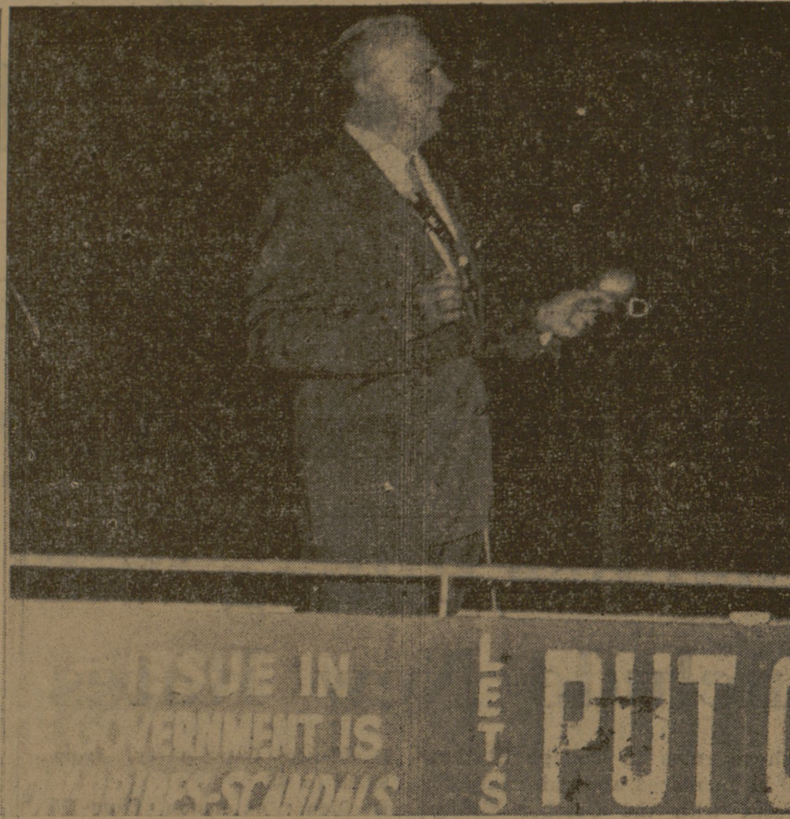
PLEASE PASS THE BISCUITS PAPPY—W. Lee O'Daniel pounds out political philosophy on how to "Turn Texas Back To The People" in downtown Bryan last night.

First place, El Navarro-Navarro; second place, Rambouillet - San Angelo; third place, Grassbur-Tarleton.