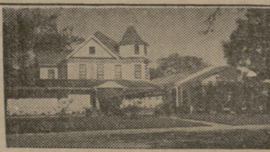
Hillier Funeral Home

BETHEL LUTHERAN CHURCH (Missouri Synod) 800 S. College Ave. Bryan, Texas 9:30 A.M.—Church School 10:45 A.M.—Morning Worship