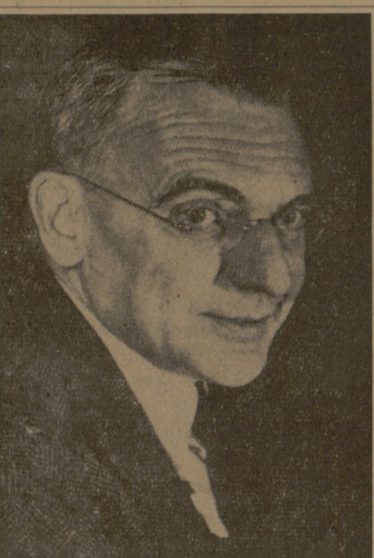
Dr. A. S. Romer Graduate Lecture Thursday

Dr. Romer has received numerous honors and awards including the Mary Clark Thompson Medal of the National Academy of Sciences for 1954. Among his professional memberships are the following: American Association of Anatomists; Paleontological Society (vice president 1939); American Society of Zoologists; Geological Society of America; American Academy of Arts and Sciences; National Academy of Sciences; Society of Vertebrate Paleontology (president 1941); Cosmos Club; Society for the Study of Evolution (vice president 1950).