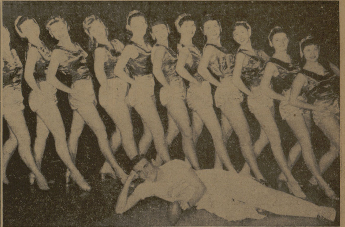
TIGER TAPPERS, from Louisiana State University

Friday at 5 p.m. is the deadline for current members of Phi Eta Sigma to submit pictures of candidates for the Cotton Ball Duchess. The selection committee asks that all freshmen wishing to submit pictures leave them with the Basic Division Office.