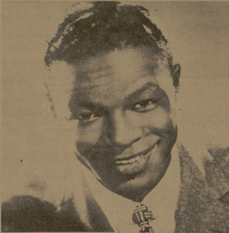
Nat 'King' Cole Star of Special Show in White Coliseum