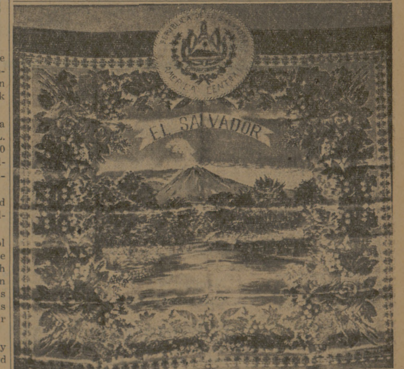
EL SALVADOR—Shown above is one of the many displays in the Student Center representing countries south of the border. The Center has devoted this week as "South of the Border Week." Entertainment and MSC employee's costumes have been designed to help celebrate the affair.