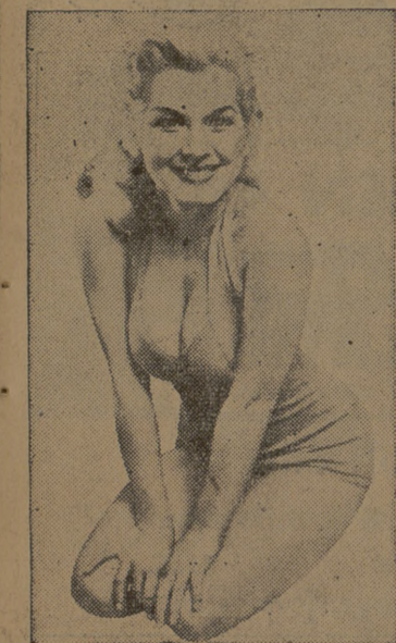
Playboy's Girl of the Month