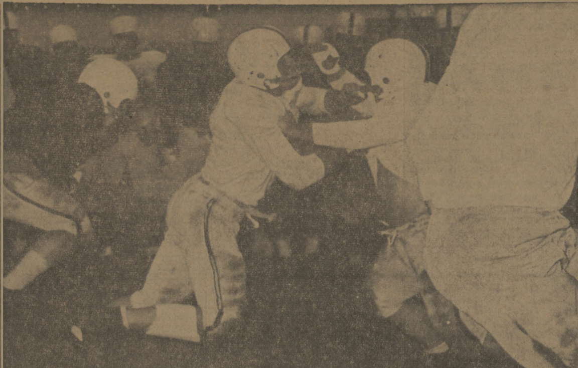
HOLD THAT TIGER! —Aggie gridders mix it up in spring practice. The Cadets have only two more days of workouts remaining.

The art of "quick-change" is another thing Coach Bryant is stressing this Spring. That is, the ability of the player to react to a sudden change from defense to offense, such as on an intercepted pass.