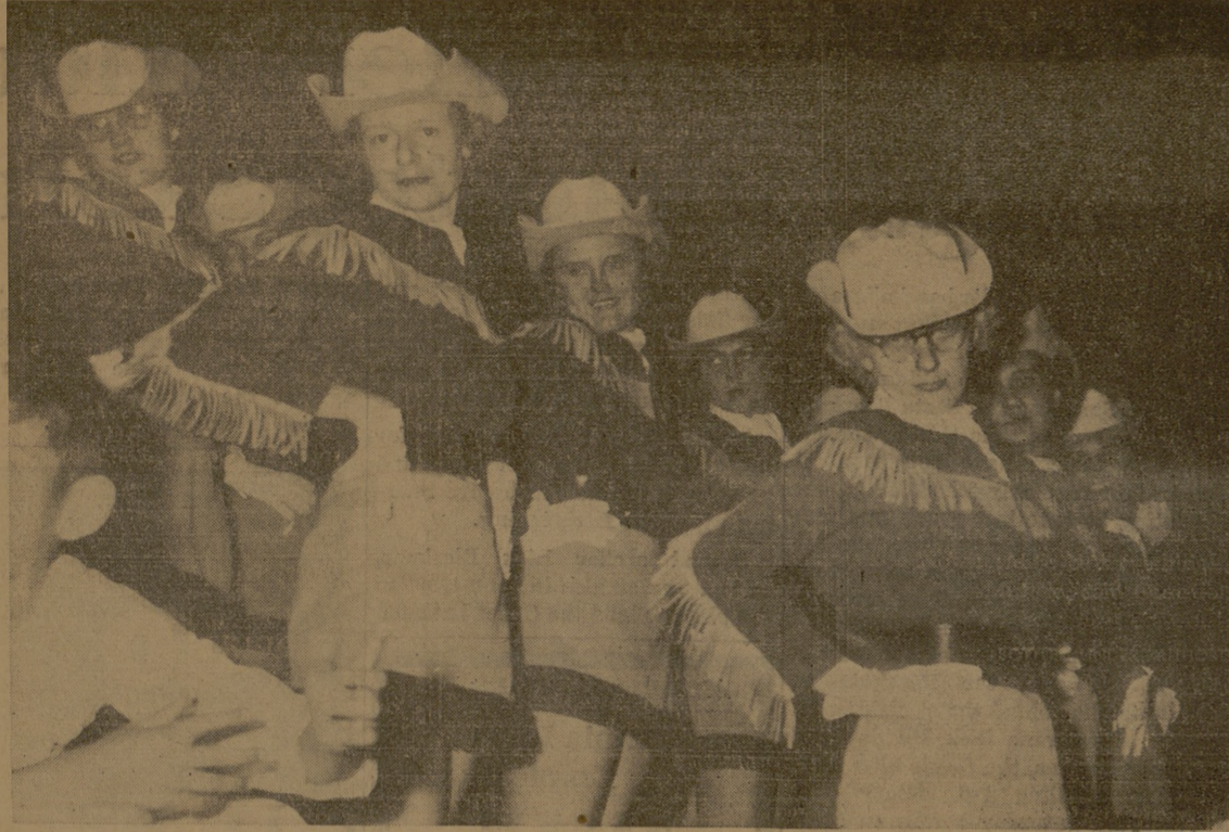
EYES RIGHT!—A section of the Wharton County Junior College Drill Team does an eyes right during one of their colorful half-time acts at last Saturday night's annual Maroon-White football game.