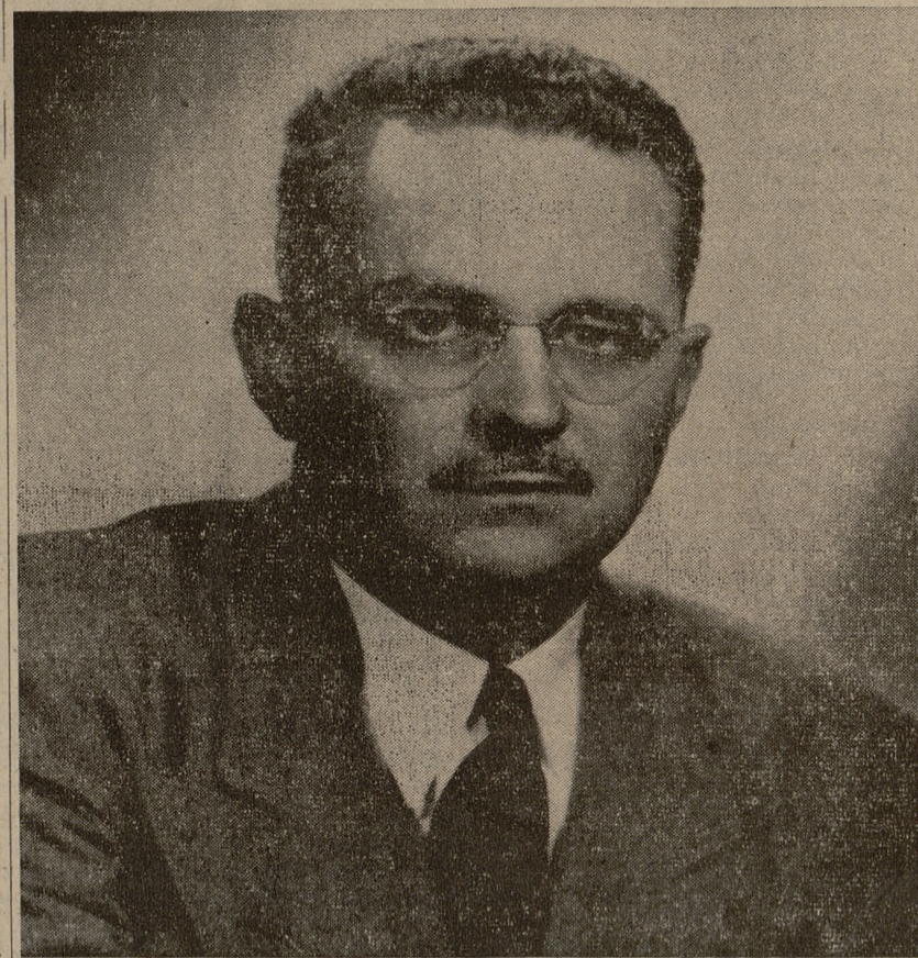
Hodding Carter Great Issues Speaker for Tonight