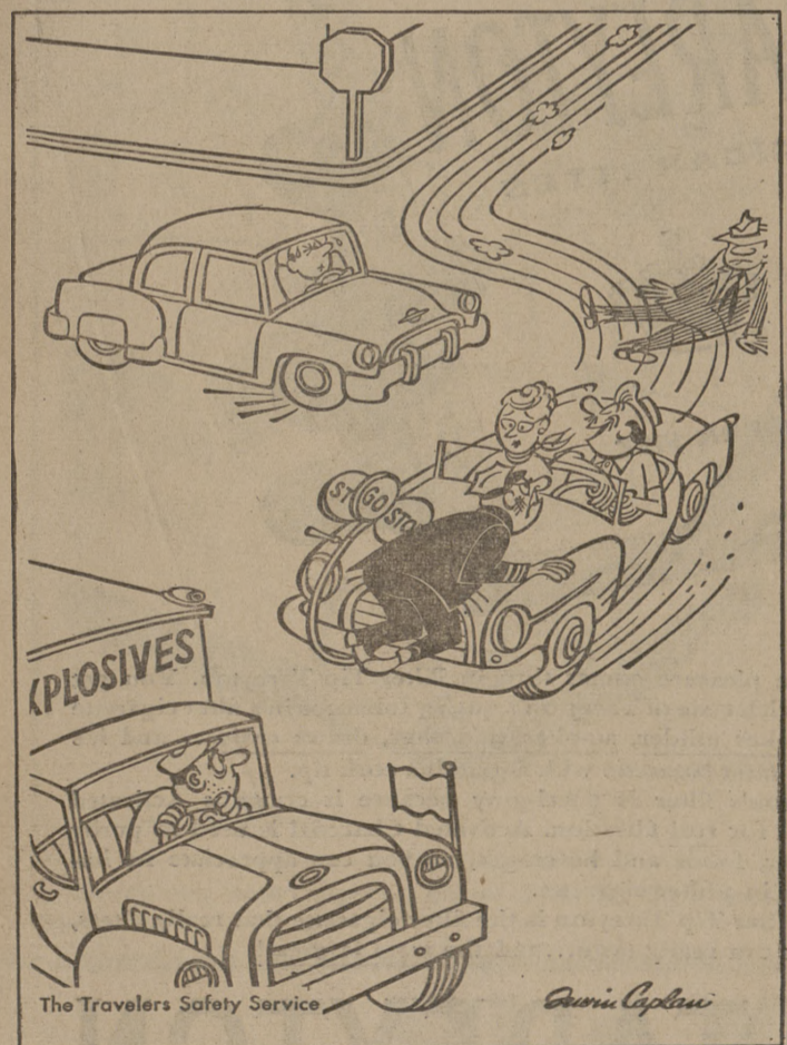
"There's still nothing wrong with the old reflexes. Notice the neat way I avoided that joker in the car back there?"