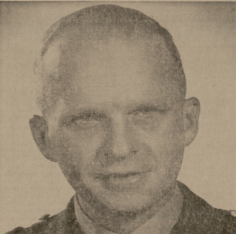
ADVISOR TO SCONA—Colonel Richard G. Stilwell, a member of the Advanced Study Group at Army War College, will serve as advisor to SCONA for the next three days. He received his B. S. degree from United States Military Academy in 1938. He served as Assistant Military advisor to U. S. delegation, Council of Foreign Ministers, Paris Conference 1946 and concurrently was a member of the Italo-Yugoslav Border Commission. Col Stil-

Although 4-H Clubs are designed primarily for boys and girls of grammar and high school age, the club works closely with the district and county agents to encourage prospective students to come to A&M and study agriculture.