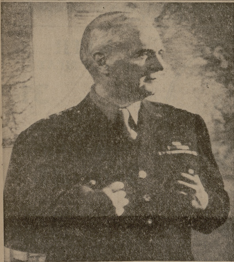
Maj. Gen. William J. Donovan