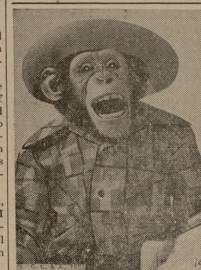
Have that Portrait made before Dec. 10 for Christmas