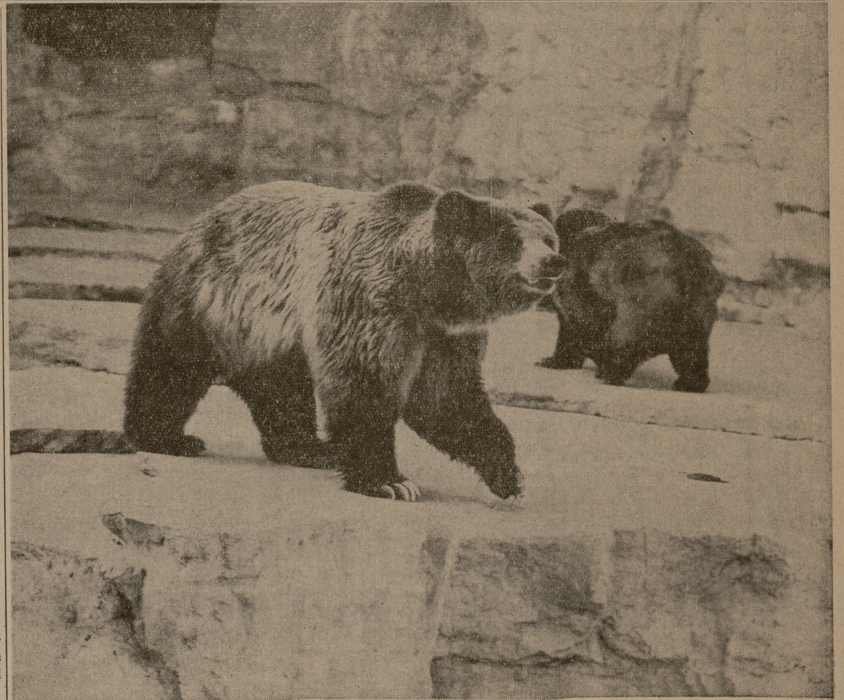
Mama Bear and Baylor Bear?

Forecast is clear with south-south-easterly winds this afternoon. Temperature at 10 a.m. was 73 degrees. Yesterday's high was 85 degrees with a low early this morning of 53 degrees.