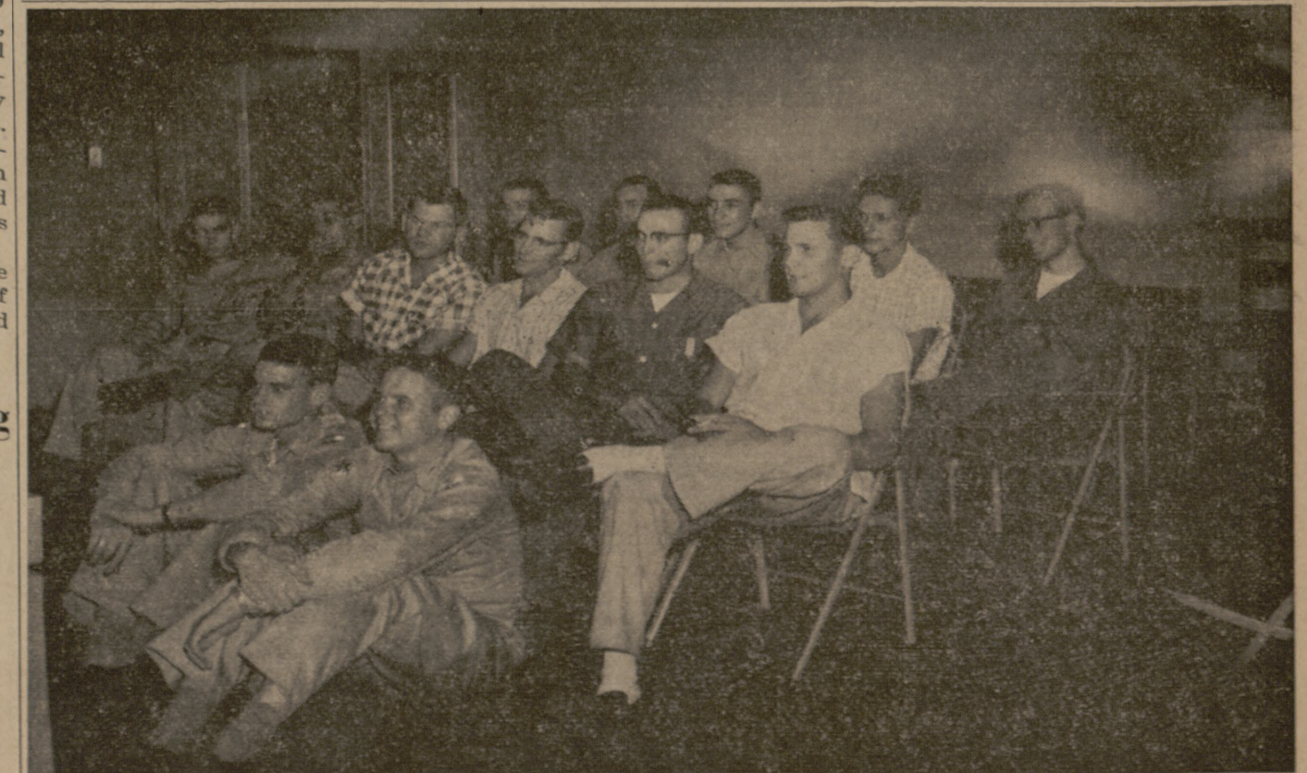
NOT DODGER FANS —These baseball fans perusing the fate of the Brooklyn Dodgers seem to be taking the telecast quite calmly; calmer, undoubtedly, than the Dodger front office is taking the outcome of the World Series so far. The MSC has its television sets tuned in to the game each day, so that anyone in the Center can yell with the Yankees and moan with the Bums.