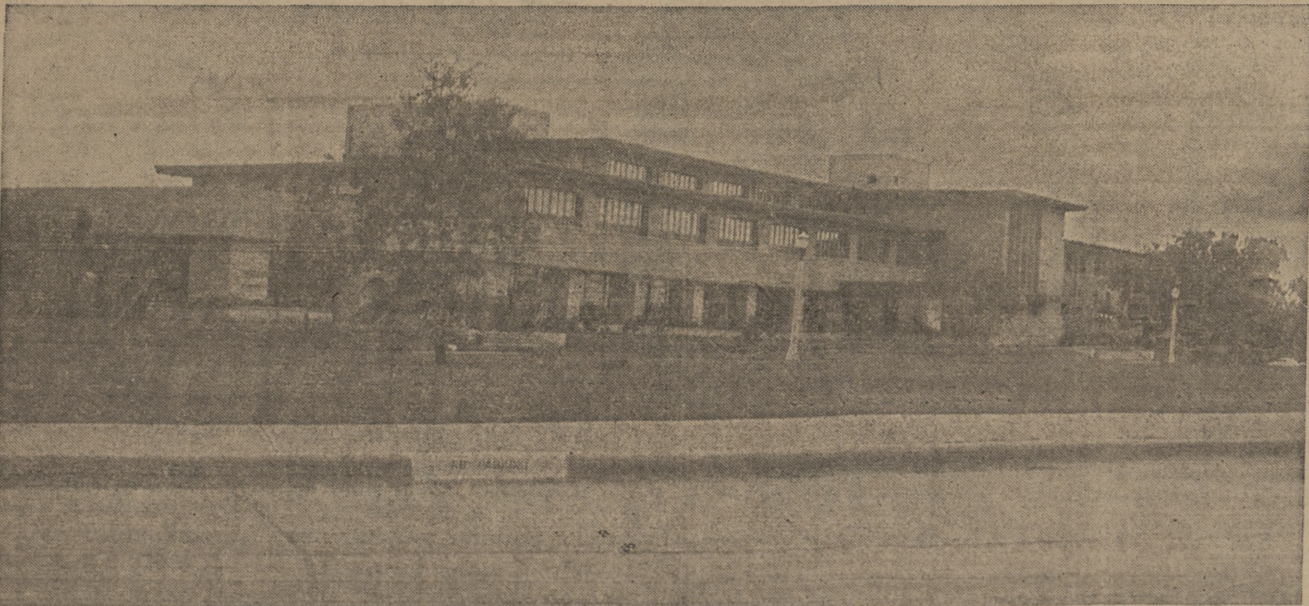
The Living Room of Texas A&M