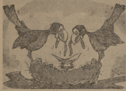
It takes TWO to fill the bill... or fashion a Christian home

Davey O'Brien, former Texas Christian University quarterback named to the football Hall of Fame this year, never weighed more than 150 pounds during his collegiate days.