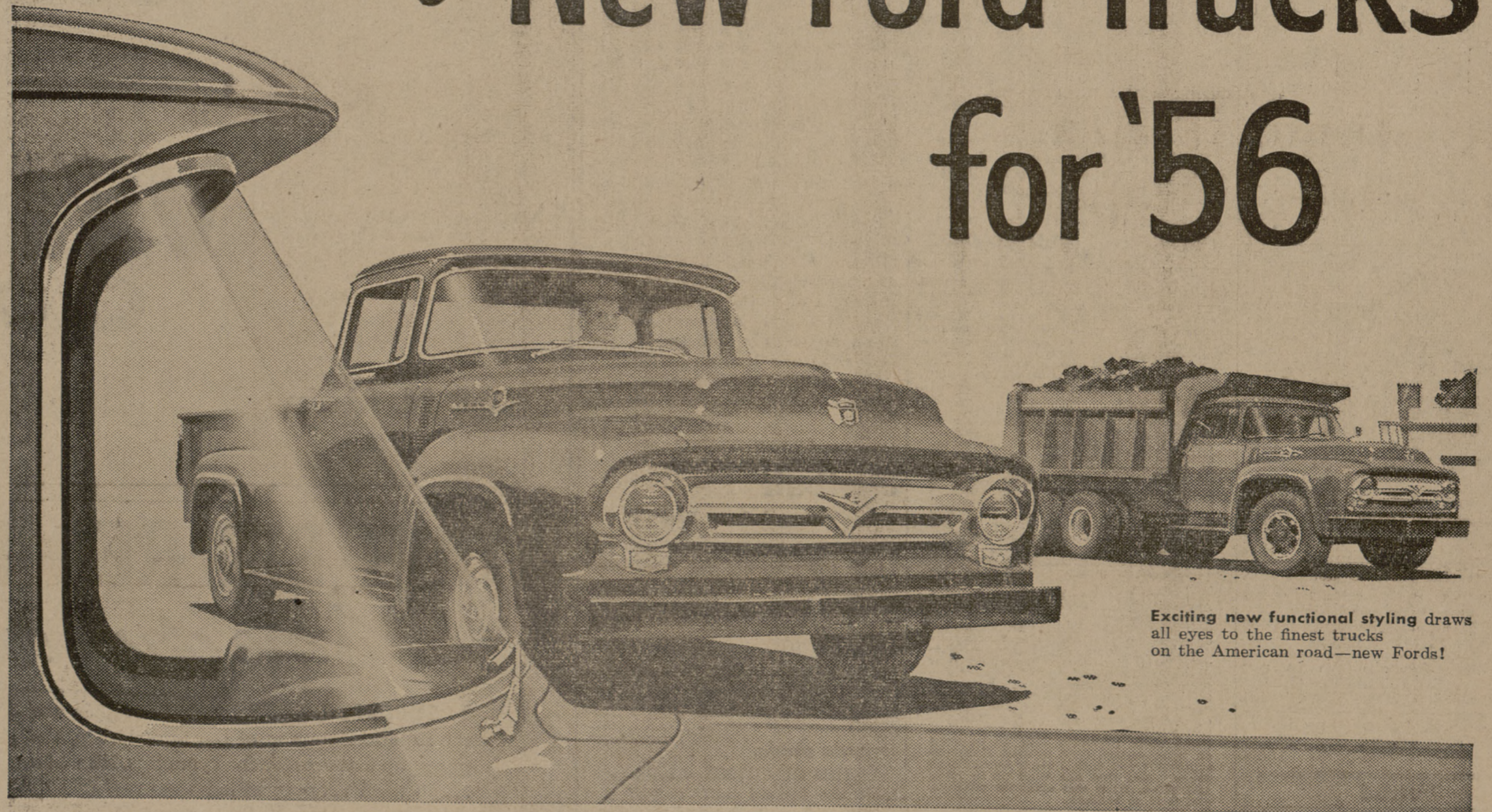
Exciting new functional styling draws all eyes to the finest trucks on the American road—new Fords!