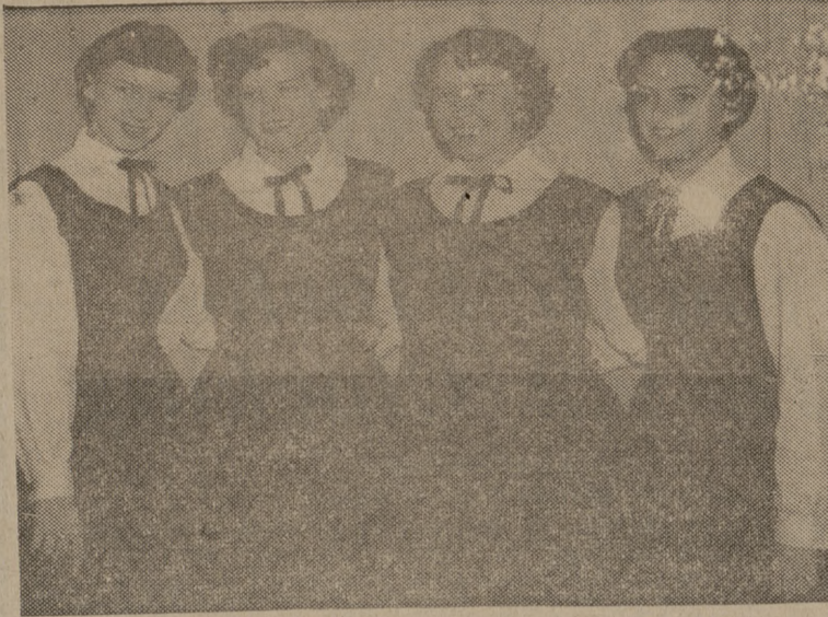
The Harmonettes To Sing Here Thursday

At yesterday's meeting a film, "The Sinews of Service," which depicted the objectives of Kiwanis club was shown. The movie presented, the Kiwanis aims, and was an urge for all Kiwanis clubs to make greater achievements in 1955, the fortieth anniversary of Kiwanis.