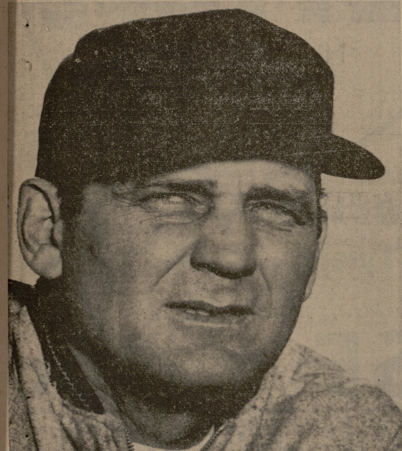
Paul Bryant, Head Coach and Athletic Director This is His Second Year at A&M