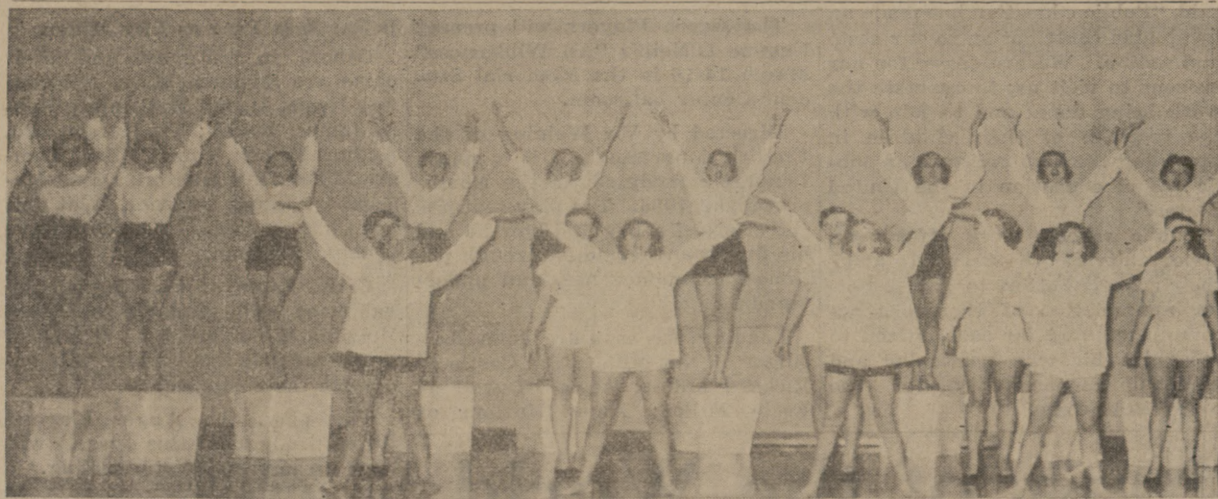
THEY'RE HAPPY —All these pretty young things are wildcatting because they're going to come to A&M for the Intercollegiate Talent show March 18. They are the act chosen to represent Oklahoma university in the show.