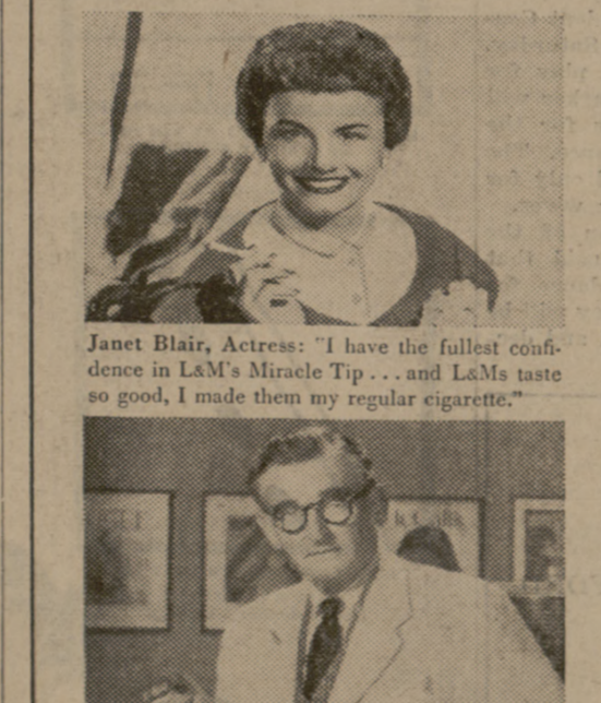
Janet Blair, Actress: "I have the fullest confidence in L&M's Miracle Tip... and L&M's taste so good, I made them my regular cigarette."