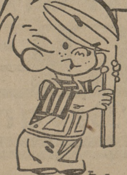
Read Dennis the Menace

Your biggest bargain— The Dallas Morning News