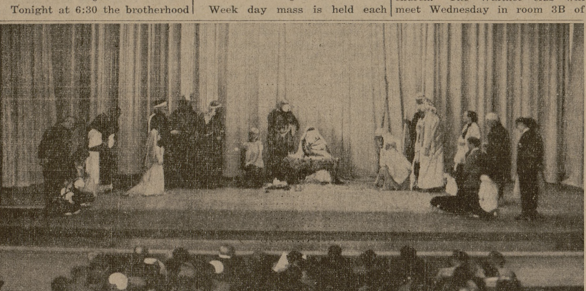
THE STAR SHINES THROUGH —This is the final scene of the community Christmas pageant presented in Guion hall Sunday night. There was standing room only in Guion hall, which seats about 1,800 persons. The pageant, "A Star Shines Through," had a cast of more than 170 local people.