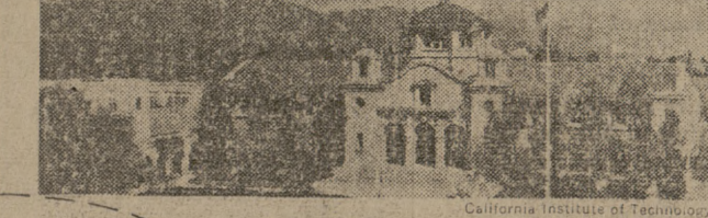
California Institute of Technology

THE HOWARD HUGHES FELLOWSHIPS in Science and Engineering Eligible for these Fellowships are those who have completed one year of graduate study in physics or engineering. Successful candidates must qualify for graduate standing at the California Institute of Technology for study toward the degree of Doctor of Philosophy or post-doctoral work. Fellows may pursue graduate research in the fields of physics or engineering. During summers they will work full time in the Hughes Laboratories in association with scientists and engineers in their fields. Each appointment is for twelve months and provides a cash award of not less than $2,000, a salary of not less than $2,500, and $1,500 for tuition and research expenses. A suitable adjustment is made when financial responsibilities of the Fellow might otherwise preclude participation in the program. For those coming from outside the Southern California area provision is made for moving and transportation expenses. for the Howard Hughes Fellowships in Science and Engineering. Address all correspondence to the Howard Hughes Fellowship Committee