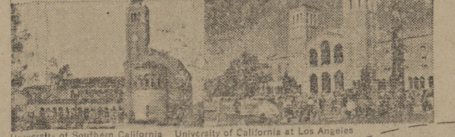
University of Southern California University of California at Los Angeles

HUGHES COOPERATIVE FELLOWSHIP PROGRAM for Master of Science Degrees A program to assist outstanding individuals in studying for the Master of Science Degree while employed in industry and making contributions to important military work. Open to students who will receive the B.S. degree in Electrical Engineering, Physics or Mechanical Engineering during the coming year, and to members of the Armed Services honorably discharged and holding such B.S. degrees. As many as 100 Fellowships will be awarded each year. Candidates must meet entrance requirements for advanced study at the University of California at Los Angeles or the University of Southern California. Participants will work full time during the summer in the Hughes Laboratories and 25 hours per week while pursuing a halftime schedule of graduate study at the university. Salary is commensurate with the individual's ability and experience. Tuition, admission fees and books for university attendance are provided. Provision is made to assist in paying travel and moving expenses from outside Southern California. for the Hughes Cooperative Fellowship Program. Address all correspondence to the Committee for Graduate Study