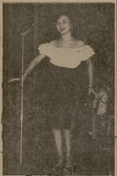
RUE PINALE —This young lady is one of the singers for the Cafe Rue Pinale floor show in the MSC tonight. Also on the show will be a can-can line and an apache dance team. Dancing will start at 8 p.m. in the games area of the MSC.