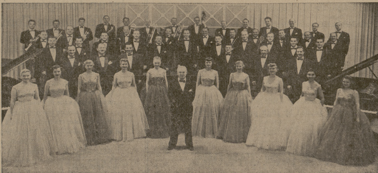
FRED WARING ORCHESTRA and CHORUS

ON SALE STUDENT ACTIVITIES OFFICE 2nd Floor GOODWIN HALL Phone (4-1149) or Mail Orders Accepted