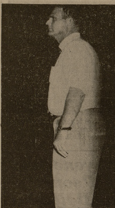
NOT AGAIN! —Coach Paul Bryant looks on with growing dismay as an Aggie back again drops the ball during Saturday's nightmare of fumbles. An alert Texas Tech Red Raider team pounced on five of the 10 Aggie bobbles to romp to an easy 41-9 win.