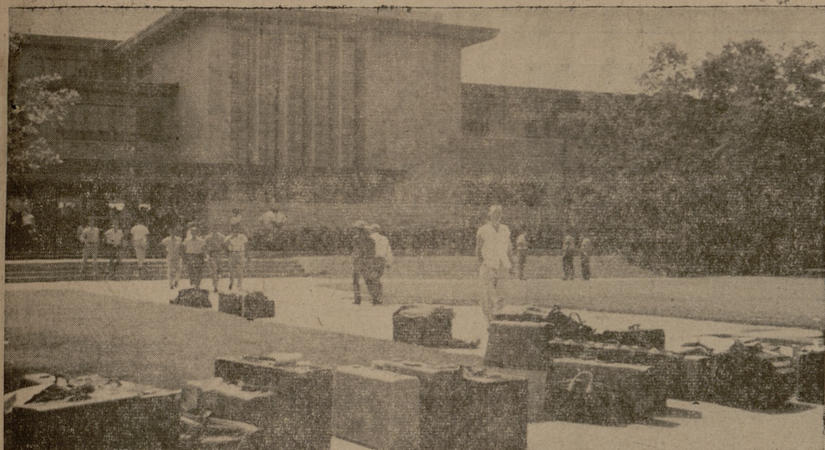
HEADQUARTERS —The Memorial Student Center was the headquarters for the registration day crowd, Friday, Sept. 10. Incoming freshmen left their bags in front while they went inside and registered with the housing office.