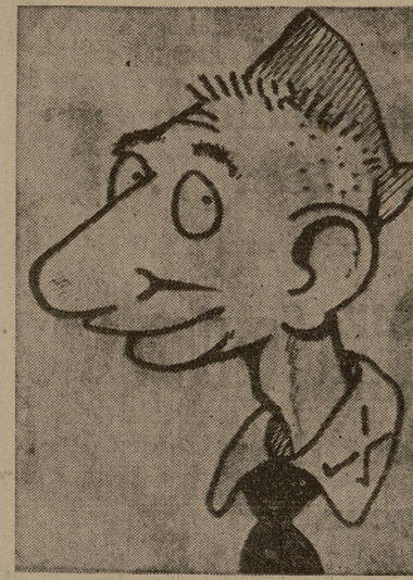
"Trade With Lou"

Save 33 1/3 to 50% On Used Books Supplies Clothing