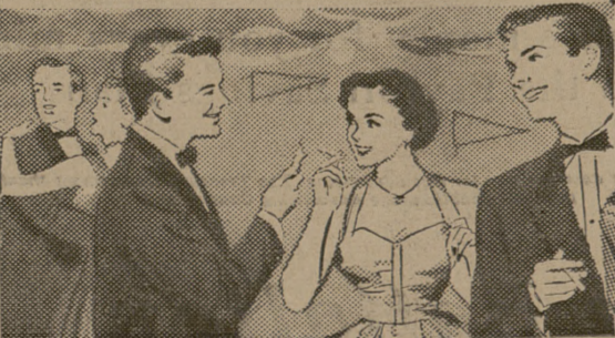
SUCCESS STORY: Camels—America's most popular cigarette... by far!

R. J. Reynolds Tobacco Company, Winston-Salem, N. C.