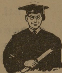
GRADUATE OF BRYAN PUBLIC SCHOOLS AND RECEIVED LAW DEGREE FROM BAYLOR UNIV.