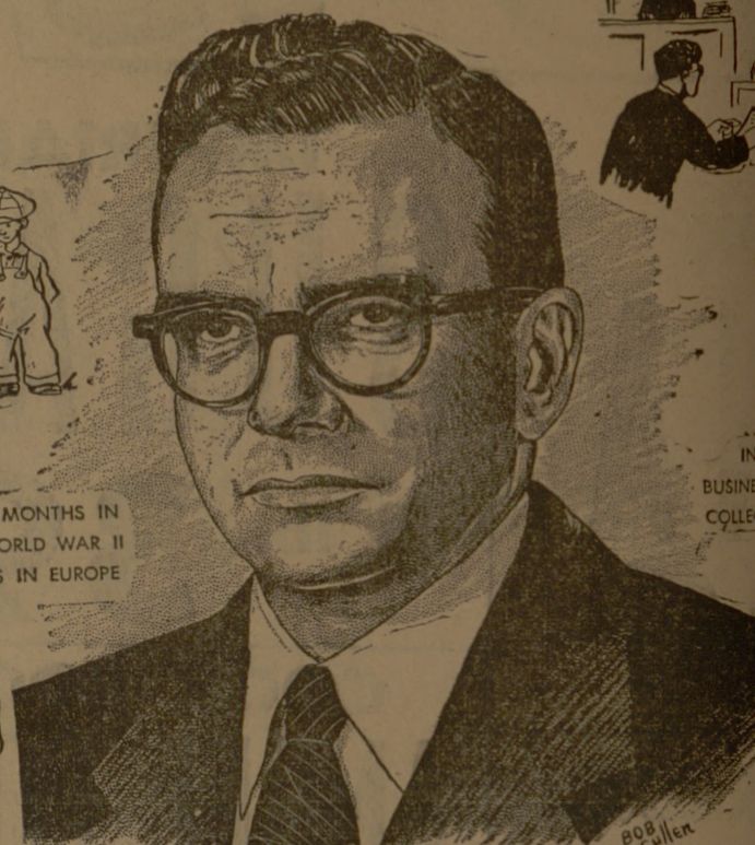
CIVIC-MINDED: Lions Club President, C-of-C Director, County Bar Association Vice-President, Sunday School Teacher.

Qualified by BACKGROUND -- EDUCATION -- EXPERIENCE