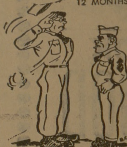
SERVED 36 MONTHS IN ARMY IN WORLD WAR II 12 MONTHS IN EUROPE